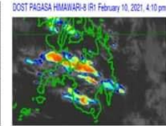
DOST PAGASA HIMAWARI-8 IR1 February 10, 2021, 4:10 pm

SYNOPSIS: At 3:00 PM today, the Low Pressure Area (LPA) was estimated based on all available data at 990 km East of Mindanao (6.5°N, 134.1°E). Localized Thunderstorms affecting Mindanao.